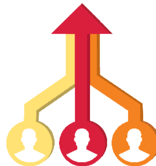
Drive Strategic Alignment